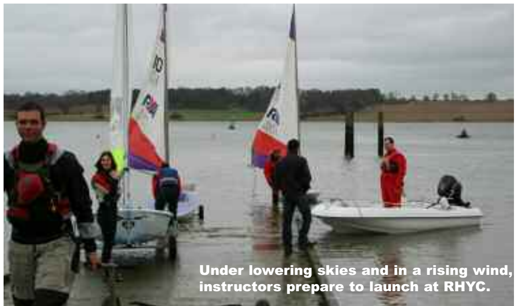
Under lowering skies and in a rising wind, instructors prepare to launch at RHYC.