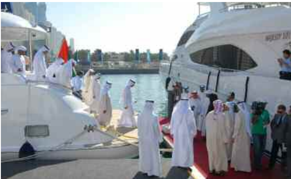
Arab potentates at the Dubai boatshow inspecting potential new motor yachts. Fuel colour and costs won't worry them.

The onus will now be on the owner of the boat to self-declare whether they are a commercial or recreational vessel and pay the appropriate rate of duty at the pump. Anyone falsely declaring they own a commercial vessel will find HMRC